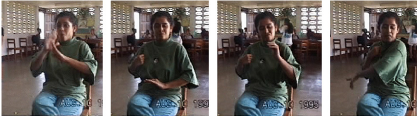
Fig. 2. Nicaraguan signer describing an event.

Perspective shifts form another prominent feature in sign languages. The words, actions and thoughts of characters can be described through direct discourse. This has been referred to in the sign linguistics literature as ‘role-shift’ (Loew, 1984); ‘referential shift’ (Emmorey and Reilly, 1998) and ‘constructed action’ (a particular form of role shift: Metzger, 1994; Winston, 1995). The example in (1) and Fig. 2 shows a user of Nicaraguan Sign Language describing the actions of a person through both signs and role-shift (RS).