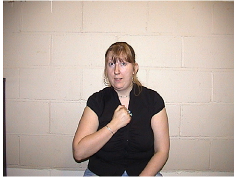
Fig. 1. Still image of sign with the handshape A.

years (Senghas et al., 2004). Unrelated sign languages are not mutually intelligible, but the European sign languages (including ASL) are typologically very similar.